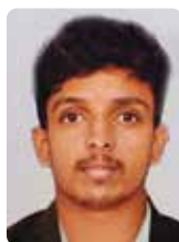
ABIN A S